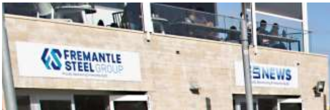
Advertising opportunities for sponsors