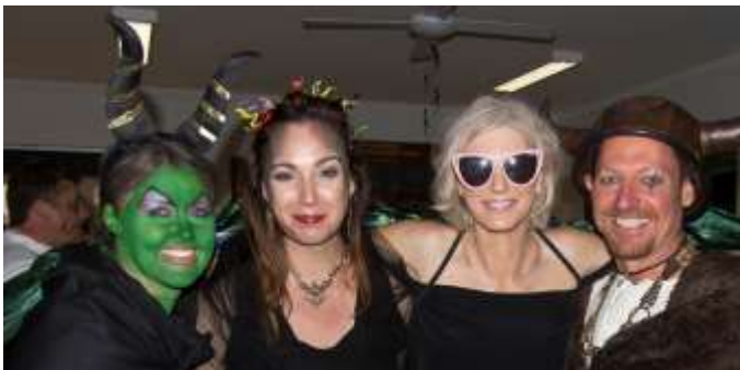
Ghosts and goblins and ghouls, oh my !

The IRB team hosted a ghoulish night of pumpkins and werewolves and everything in between late in October. Costumes were spookily creative and the atmosphere chillingly groovy. 120 ghosts and goblins and other fantastic beasts rocked up for the lollies and food with a special mention to those that created some eerie pumpkin carvings! Well done to Kitty and the IRB Team for such a spectacular night.