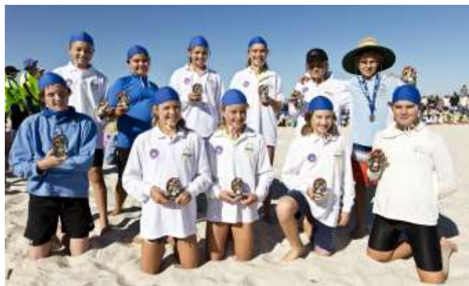
Eleven of our U13 received their Long Service awards