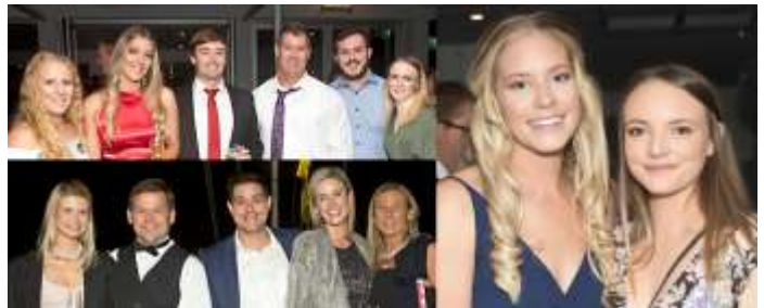
Putting on the Ritz for the Annual Dinner