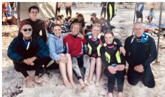
Fremantle IRB Racing team at Worlds

We're very proud of all our Worlds competitors !