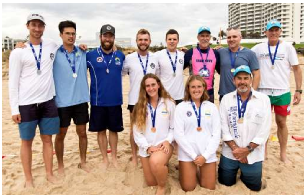
Surf boat medallists at the State Championships at Scarborough

Our culture and competitive edge have improved again this season with excellent numbers rowing and terrific results at the State Championships. Training has stepped up a level while camaraderie and sheer enjoyment has been evident throughout all crews and supporters. It has been wonderful to see our rowing community expand and develop with parents and friends attending and becoming involved our passion – surf rowing.