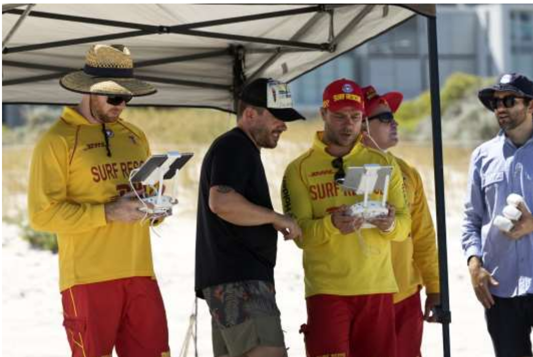
Club members undergoing training in the use of drones for patrol