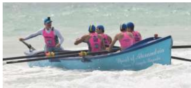
Forgers earned bronze at States

State Titles and finishing sixth in the final of the Reserve Women. Great promise for the future.