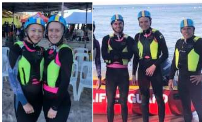
Fremantle competitors at the Lifesaving World Championships at Glenelg