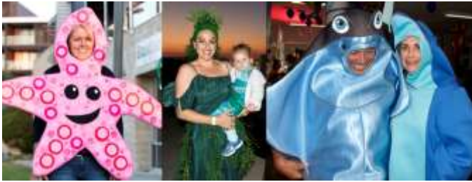
'Under The Sea' evening kicked off the social year in a big way

Remantle Surf Life Saving Club is growing, with people that love the beach, who are pushing to achieve personal goals, parents who want their kids to be involved in Nippers and people volunteering for patrols. Whatever the reason, we have so many things in common and one of those is getting together and having fun. Social events are great opportunities to relax with old friends and make new ones as well as welcome all the new members we have at the club. Sing a long as we look back at all the good times we had.