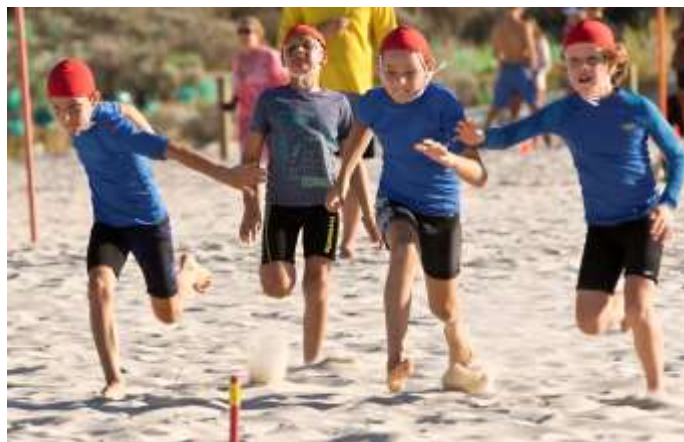
The Twilight format for beach Club Champs was a real hit !

Our Twilight program was again a big hit, with the format for twilight nippers and Club beach Championships a hit with families. After the Club Championships were done, a few well-earned beverages and some food completed another beautiful night down at Leighton Beach. There were some tight finishes, with judges consulting iPhones and iPads to ensure the correct result was recorded in a highly competitive atmosphere, with sportsmanship high on the agenda.