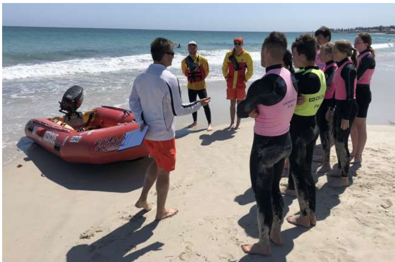
Bronze Medallion assessment