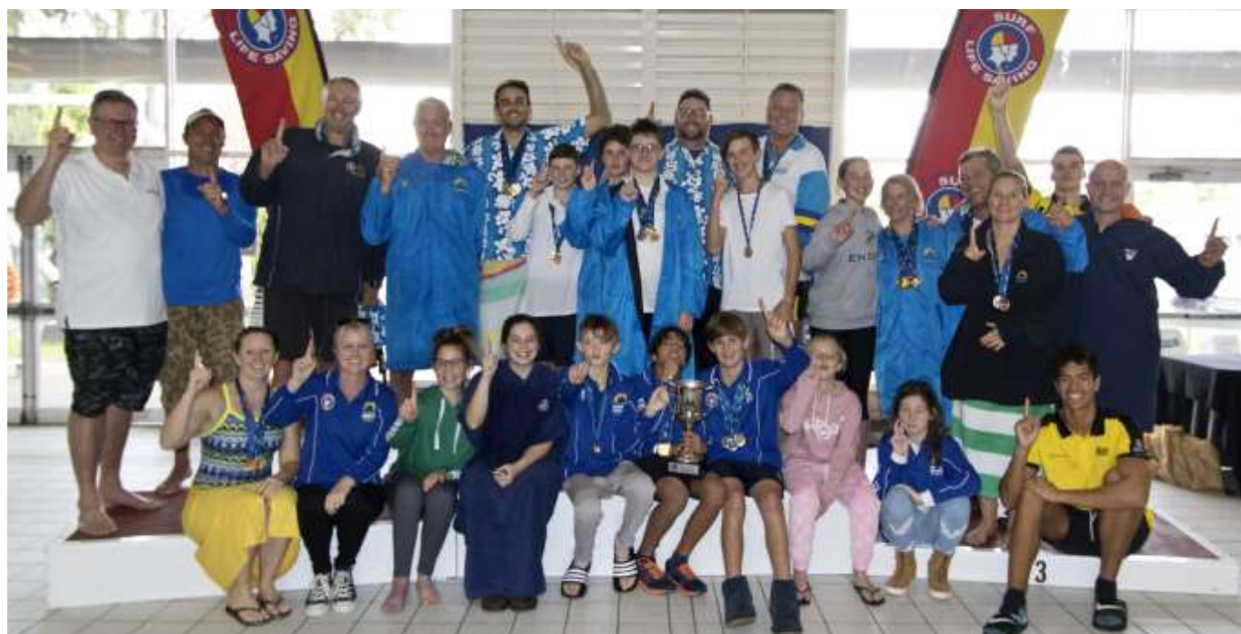
A fantastic contribution from all age groups - Juniors, Seniors and Masters, seen here proudly holding the inaugural Pool Rescue Championship Cup