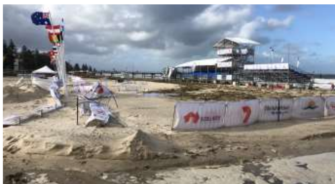
Devastation on the sprint track (above) and storage yard (below)