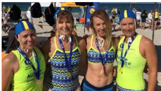
Our 170+ female and 200+ male beach relay teams won gold medals