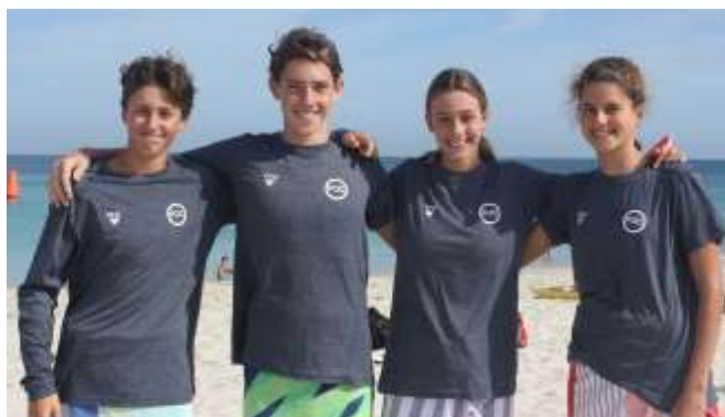
Winners of the 4 x 500m teams - "Just in Time"

The FOC Planning Committee is already hard at work, planning for next year's event and bring a new expanded program to a wider audience on February 15th, 2020. Put it in your calendars !