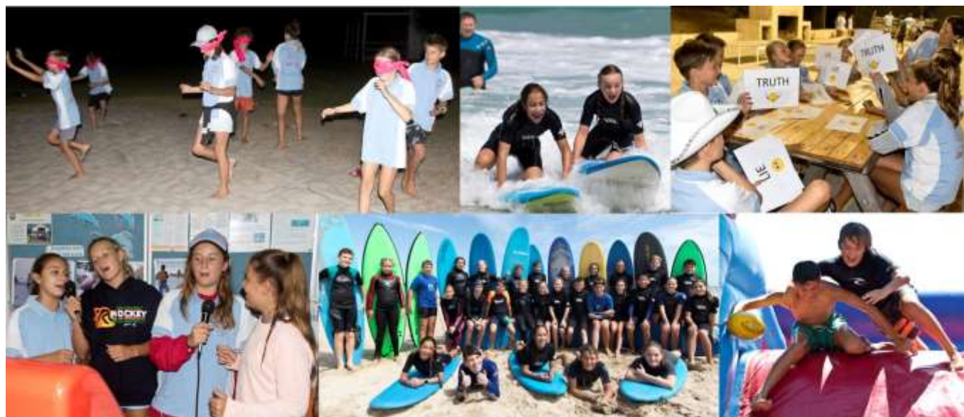
A big turnout of happy smiling faces at Nipper Camp