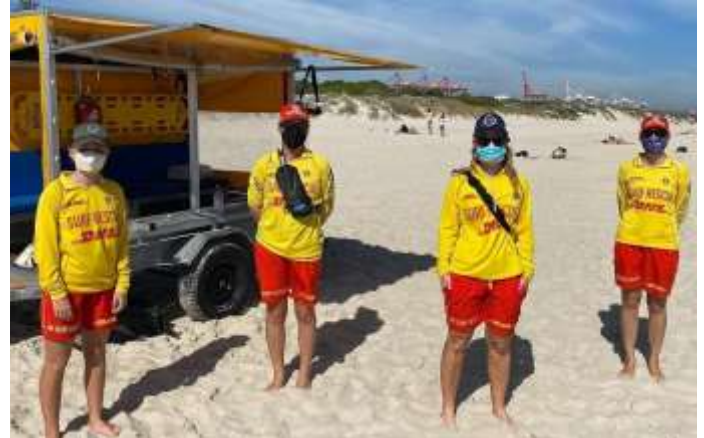
The Fantastic Four of Pink Patrol!

The inaugural Pink Patrol, created our Lifesaving Committee to recognise and respect women in surf lifesaving, was unfortunately affected by the lockdowns and COVID-19 restrictions. Ultimately, the twenty-five members scheduled to patrol on our last day ended up being a small group of socially distanced four.