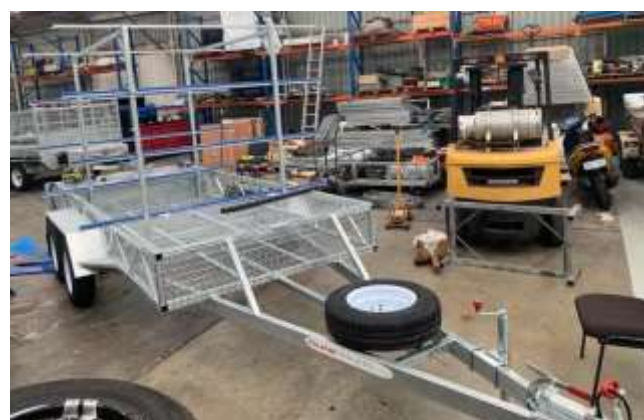
Our "Emergency Grab Bag" with a new defibrillator (left), the new Ski Trailer (right)