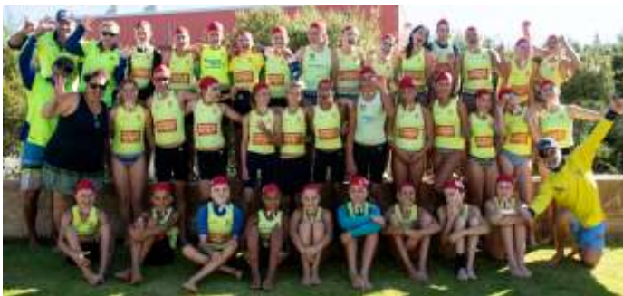
Our Under 13's say farewell to Nippers !