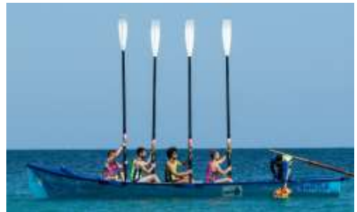
Oars raised in salute