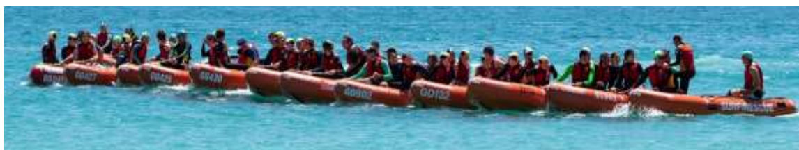
At the end of States, all teams performed a 'fly-by' along the beach

To my team - throughout all the challenges that this season has thrown up, you've shown yourselves to be resilient, enthusiastic, and dedicated, and you make me proud to be your Captain. It has been a pleasure, and I look forward to next season.