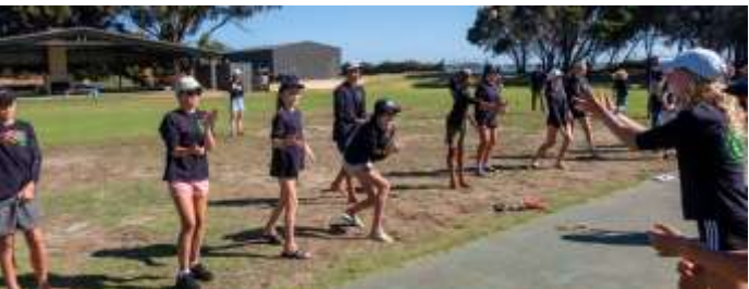
Nipper Camp - the "funnest place on earth"!

Fair to say, firm memories were made, with highlights being epic foxholes for spotlight, snorkelling, surfing and the ever-entertaining talent show. By 10am Sunday morning, families collected their respective Nippers, who were all suitably exhausted from living their best life building friendships, pushing their limits and making great memories along the way.