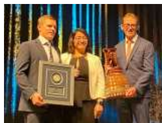
Winner, Patrol Club of the Year