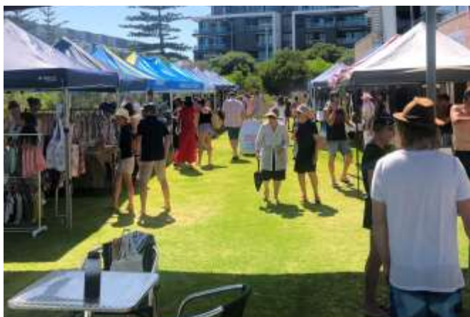
A great turnout for our Christmas Market!

In December, the Club hosted its very first Christmas Market. A total of 28 stalls were filled by small local businesses, allowing them to showcase a range of handmade products. It was great to see many Club members hold their own stall and show off their own creations to the community.