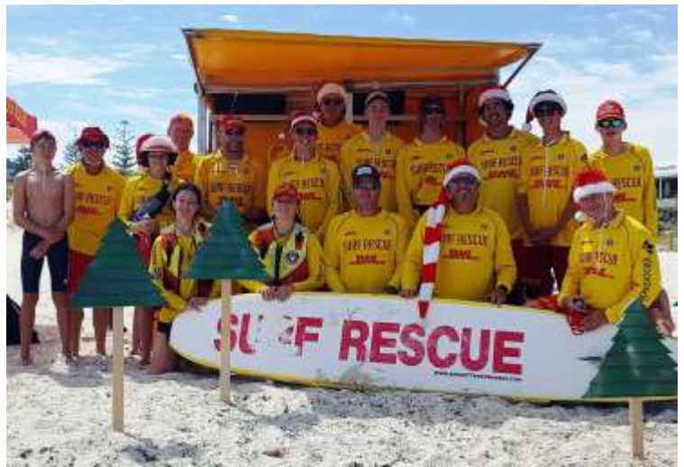
Christmas Day Patrol