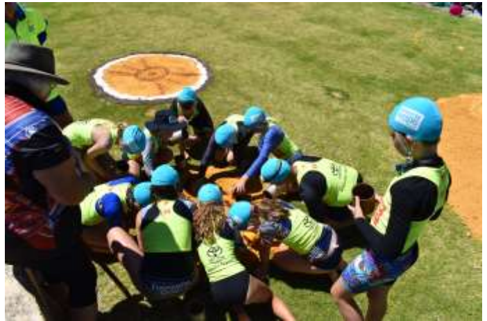
A group of enthusiastic nippers creating the mural

This season the Club's Reconciliation Action Plan (RAP) was formally endorsed by Reconciliation Australia on February 18th, 2021. Our RAP sets out twelve goals that will guide the Club's reflection and planning towards reconciliation. The RAP Working Group has been working alongside the Club's community to lead positive actions helping to build knowledge, understanding and pride in Aboriginal and Torres Strait Islander cultures.