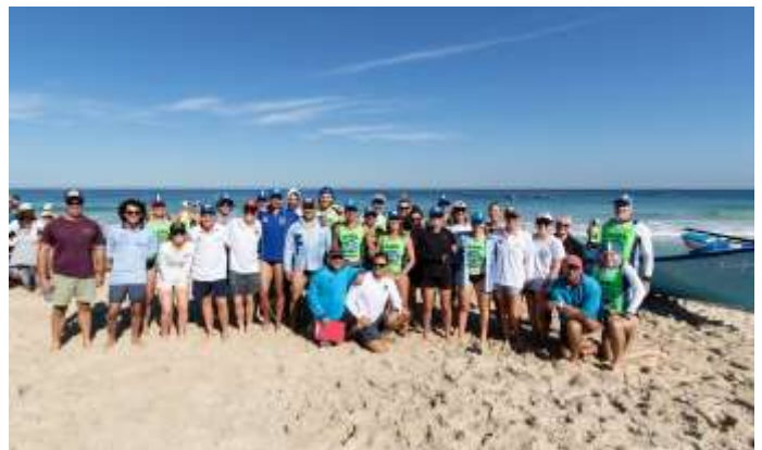
The boaties contingent at States

With a commitment to develop new sweeps and engage the youth members in our Club into surf rowing, we look forward to the future and seeing our competitive crews competing at the ASRL Open and the Australian Championships.