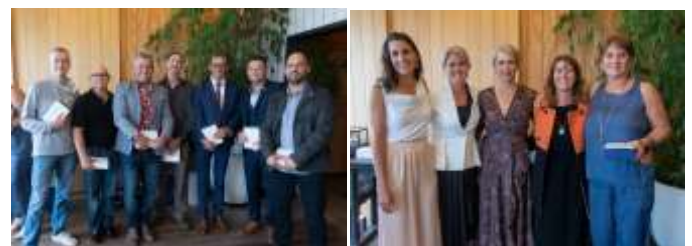
Some of our Masters winners at the Surf Sports Awards and Annual Dinner

If you have some great ideas to add to the fun at our club for all members, please come and be part of the Social Events team!