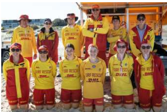
The first of two Captains and Vice Captains patrols to start the season

Lastly, congratulations again for a challenging yet enjoyable season and for keeping our beaches safe. Stay safe and see you in the new season.