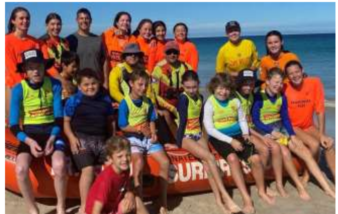
The Starfish crew !

Starfish Nippers is a modified and structured Nipper program that is designed for young people aged six years and above with a disability, including physical and intellectual disabilities and learning difficulties. The program focuses on beach and water safety and awareness, promoting inclusion and diversity and can be modified to suit an individual's needs. This season, we started with five nippers and over the season grew to nine, with commitment from all to join us again next season.