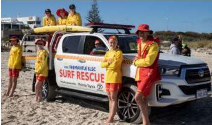
Our new Toyota Hilux 4WD courtesy of sponsor Melville Toyota

Melville Toyota came on board in early 2020 as a major sponsor, with the provision of a new patrol 4WD vehicle, including registration and servicing. The vehicle is of course an integral part of surf patrol equipment. Melville Toyota also co-sponsored the 2020-21 season nipper vests for our 610 juniors.