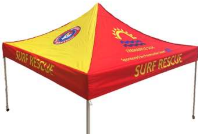
New patrol tents provided through Fremantle Steel's sponsorship