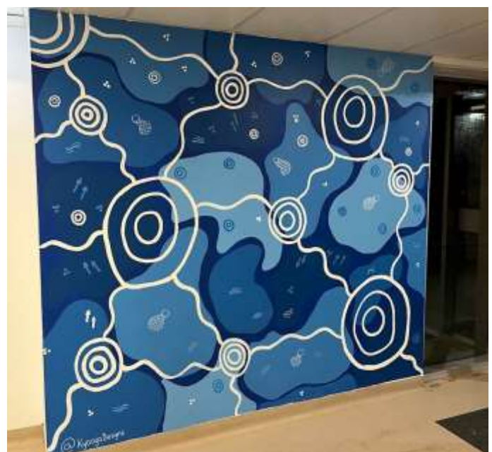
Our new entry way, design by Kyooya Designs