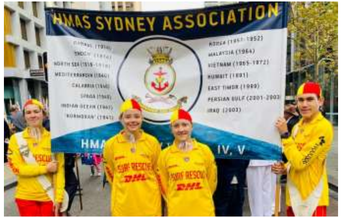
Anzac Day Parade

For the second time,our Fremantle Youth were invited to march with HMAS Sydney Association alongside the veterans in the Perth ANZAC Day parade. We hope this will continue to be a tradition endorsing our commitment to the long-standing relationship and history between our Club and the HMAS Sydney II Memorial