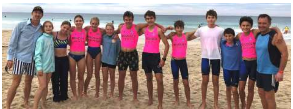
Fremantle 'beachies' at Aussies, Trigg Beach

Remember: The strength of the team is each individual member. The strength of each member is the team.