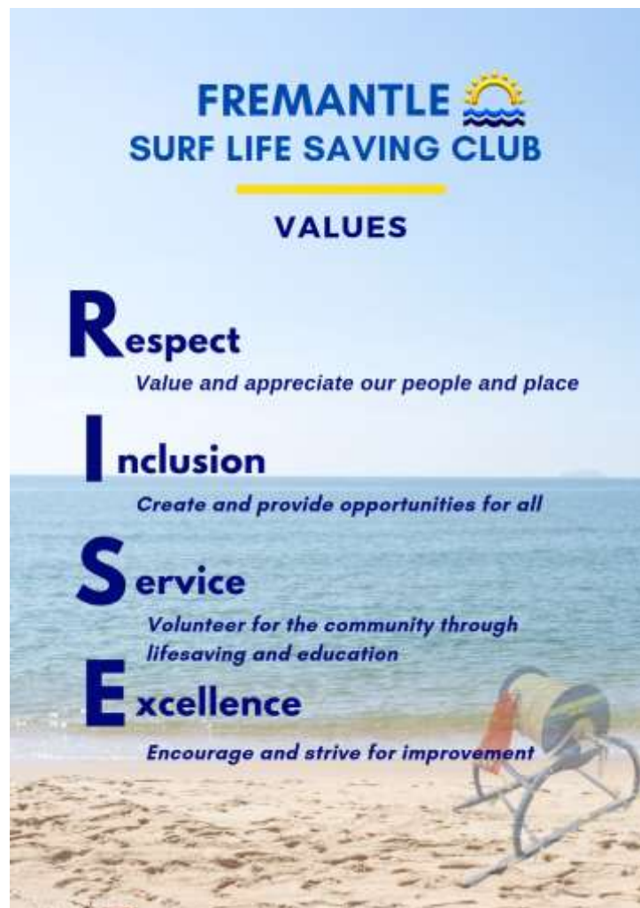
The Club's new Values Statement