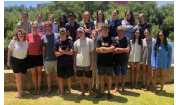
New Bronzies from the intensive Bronze Medallion courses in October 2022 and January 2023