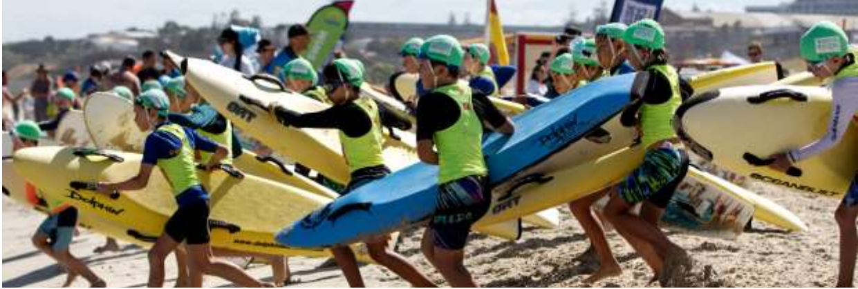
An amazing turnout for the Nipper Club Championships

them while always showing absolute respect. Congratulations Finn and all the best for your transition to Youth.