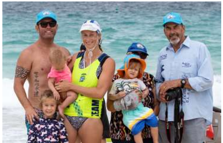
Generations of the Duffield family