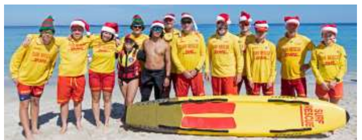
Making sure the beach is safe over Christmas