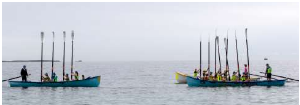
Oars raised at the Coogee carnival as sign of respect in memory of Colin Duffield