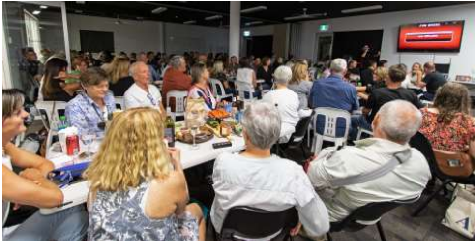
The Quiz Night was an outstanding success, raising $5500 for the Club