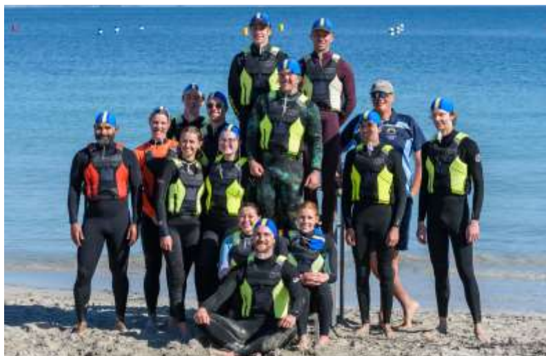
The 2023 Fremantle IRB Racing team

Finally, we would like to acknowledge and thank the Club sponsors for their continued support of IRB's at Fremantle.