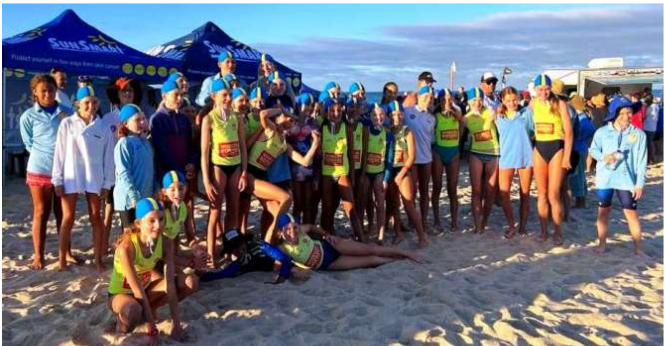
And, a return to large numbers of Fremantle caps at Junior States !

Thank you again for all your tireless support throughout the season, Fremantle Nippers couldn't have succeeded without the effort of everyone involved year in and year out. I look forward to seeing everyone back on the beach next season.