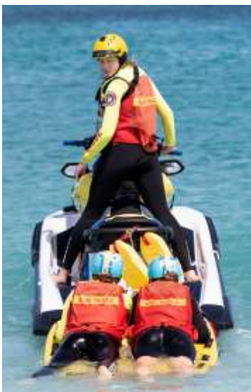
On-beach member training

In true Fremantle form, we have continued to provide great